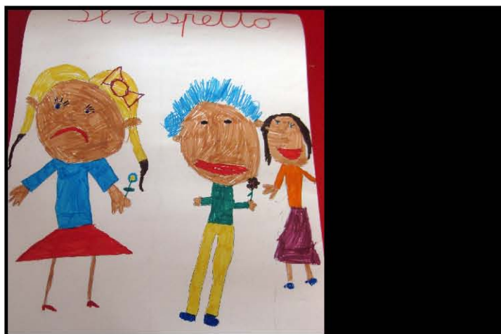
A drawing made by a 6 year old during a class activity on the topic of respect.