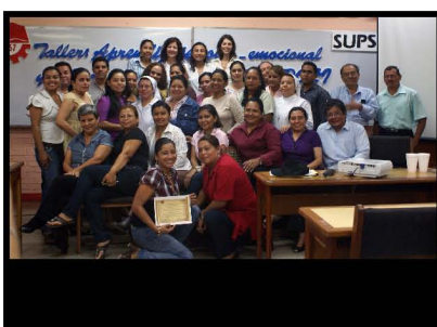
Nicaraguan teachers who participated in the training on social and emotional learning.

the change we want to promote in our societies, in order to achieve a better life standard everywhere in the world. Moreover, since the two institutions play a significant role by fostering and regulating public education in the society, this project is although to see as a contribution to Millennium Development Goal number 2: "Achieve universal primary education".