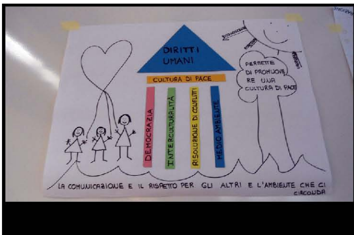
A model made by teachers during the training on peace building.

The identification of the most relevant practices in training teachers in social and emotional learning and peace building skills and the collection of materials, which begun with this project, need to be deepened and carried on for more time in order to allow the creation of concrete and cultural adapted proposals for the further promotion of both themes in the basic and continuing education in the two countries. This aim will be proposed to several strategic partners, with whom the two institutions have established interesting relations thanks to the project.